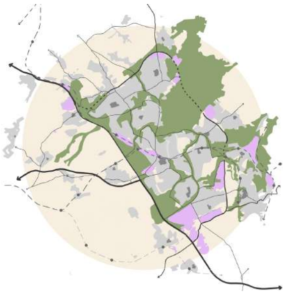
Green Scenario focuses on downgrading the oversized roads and creating a green network