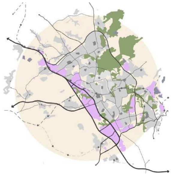
Cluster Scenario fixes fragmentation in the region by moving all functions into one big area