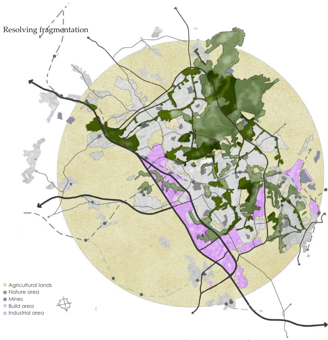
Current fragmented region