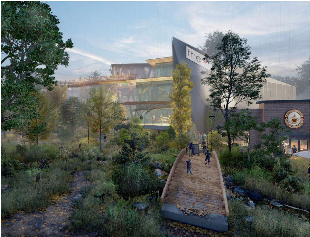
Impression of Parkstad Mall

Parkstad Mall is a conversation piece to start the region off with. It is a mega mall, where all different functions within the region are moved to one well connected area. This will relieve the rest of the region of the moving functions. It will be able to connect some of the region rather than the fragment it even more.